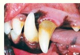
Photo of gum disease in an adult dog. Note the build up of yellow calculus.