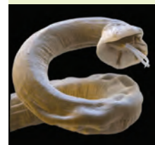
Electron micrograph of an adult lungworm

Angiostrongylosis, caused by the parasite Angiostrongylus vasorum , has been present in the UK and the Republic of Ireland for the last 40 years in patches or "hotspots", but is now spreading North across the British Isles. While still relatively uncommon in the North, new cases are being identified all the time. It is also known as the French/ small heartworm or lungworm (to distinguish it from Dirofilaria – the large heartworm found in mainland Europe and the USA).